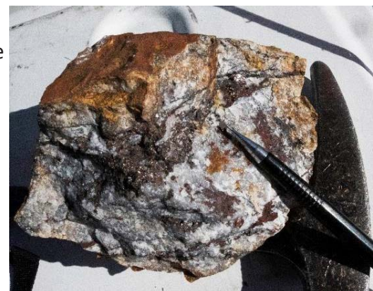
VQA Float sample: 16.2 g/t Au, 10.6 g/t Ag

Note: Investors are cautioned that a qualified person has not done sufficient work to verify historic drill intercepts or the reported past production; the Company discloses these results to demonstrate potential beneath post-mineral cover.