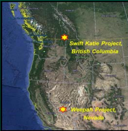
Property Locations in North America